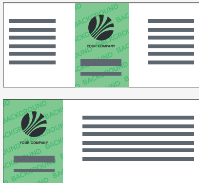
Examples of background color use that we can print.