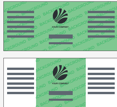
Examples of background color use that we can not print.